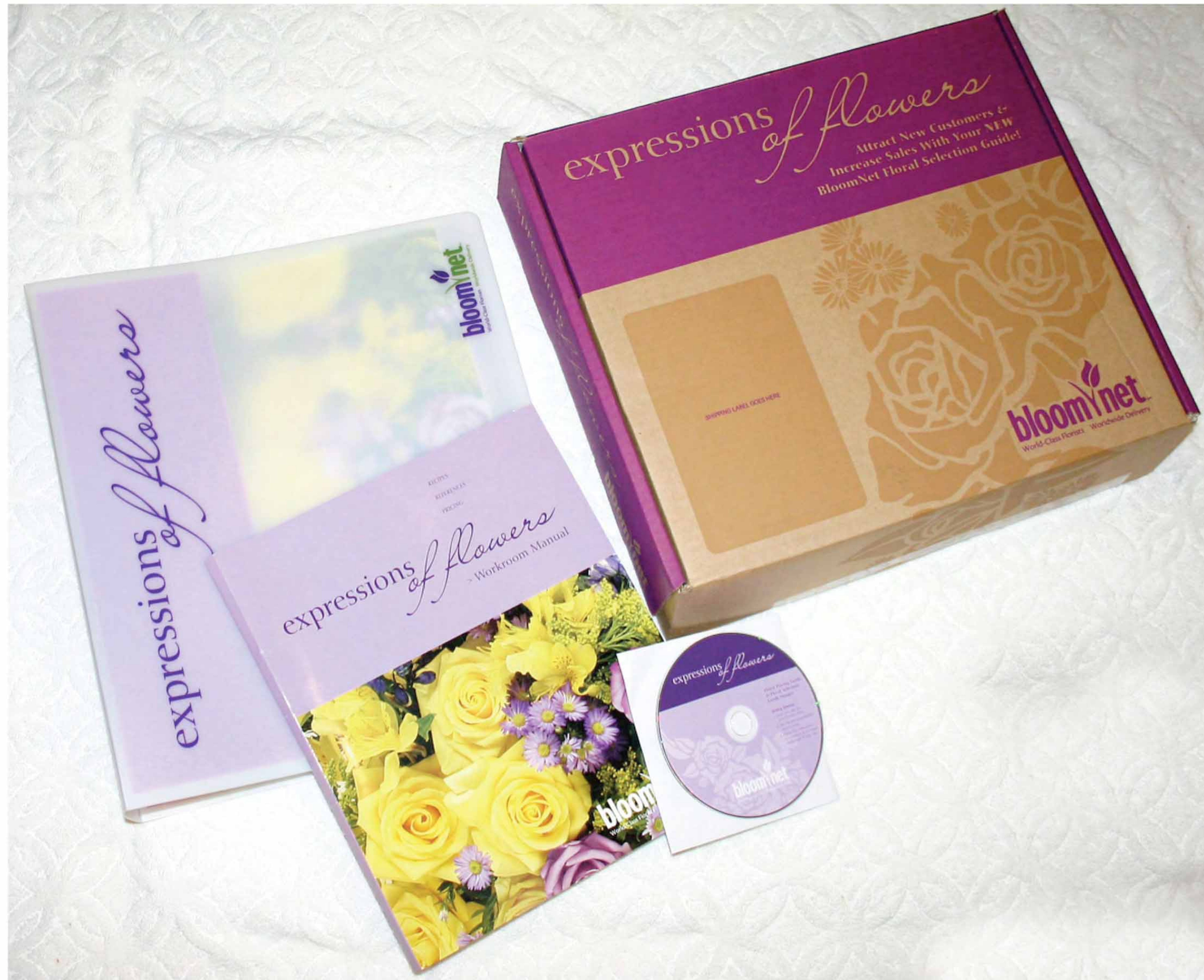
– Retail Package Design-Shows Complete Package Design – Client: Bloomnet (1-800-flowers.com) 1-800-flowers.com Retail Package Design with complete selection Guide. Workroom Manual (Recipes, References, Pricing) & CD-Rom Instruction