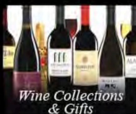
Wine Collections & Gifts