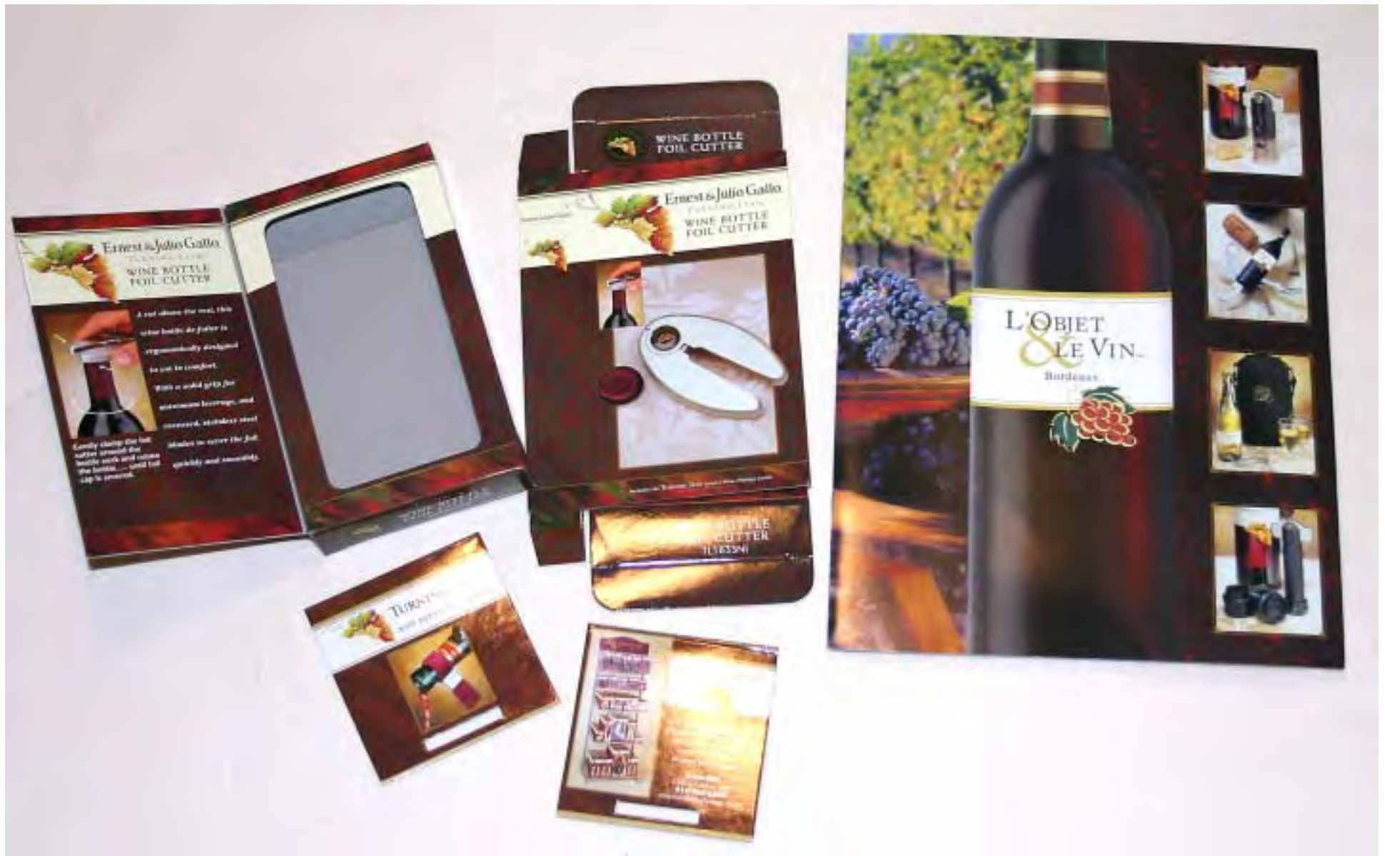
My role: Art Director - 2004- from design concept to finished print production. For: E& B Giftware. Packaging, Sales Catalogue & Giveaway promo.