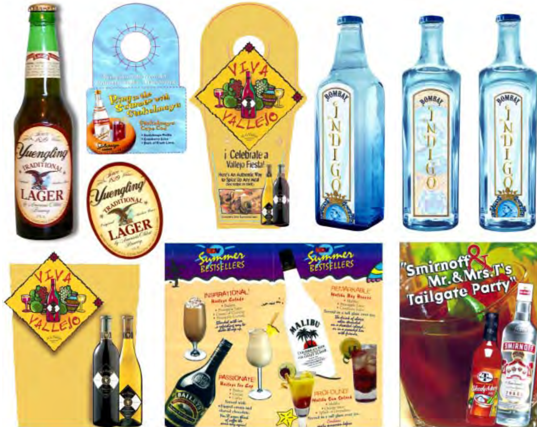
My role: from design concept to finished print production including image creation & template. For: Alcone Marketing, D'Addario Design & more...