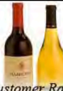
Customer Rated Favorites