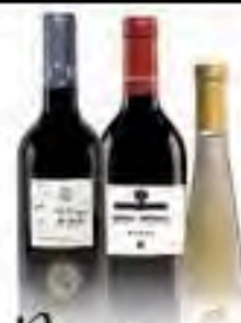
The Prestige Collection