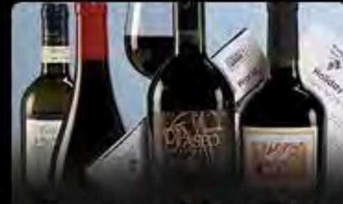
Passport Wine Club